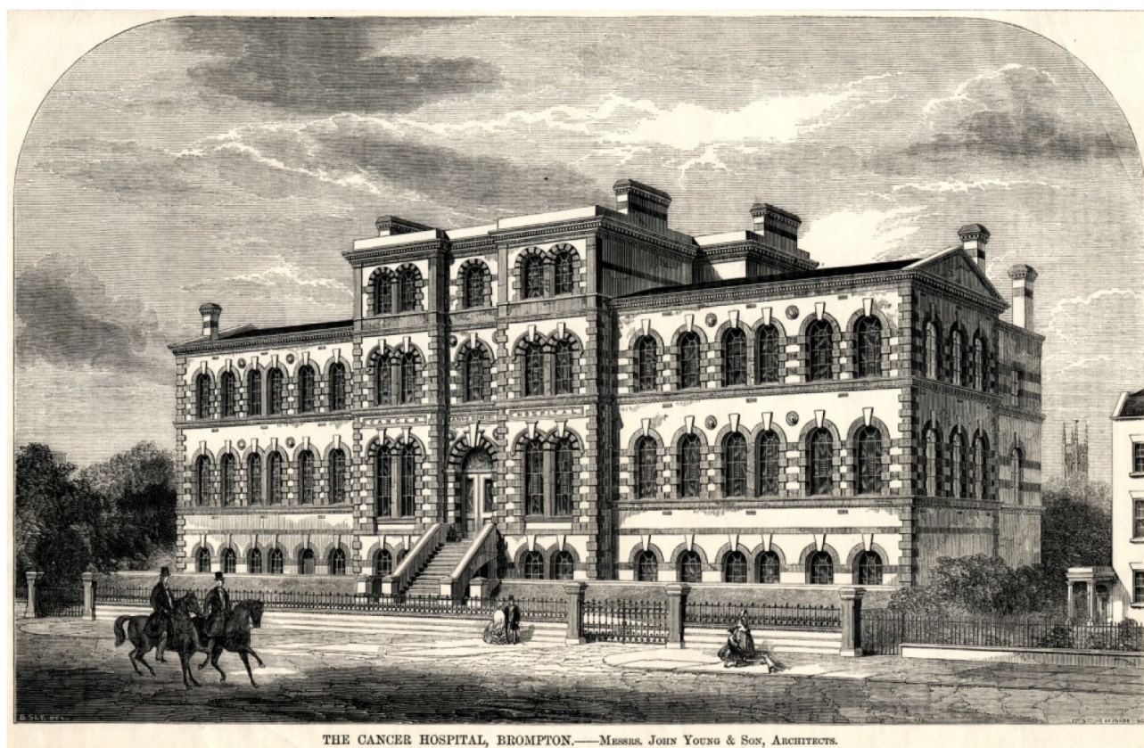
Figure 4. The Royal Marsden Hospital in the 19th century, known as London Cancer Hospital.